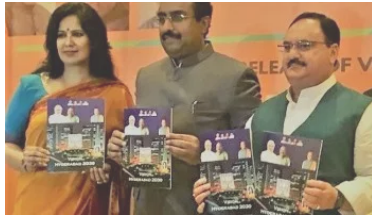
Narendra Modi led BJP unveils 'Vision Hyderabad 2030' 09/12/2018 In "Smart Cities Mission"