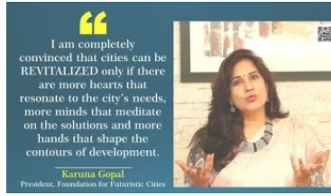
Smart cities meant cities that are progressive with 'universal infrastructure' 24/12/2018 In "Interview"